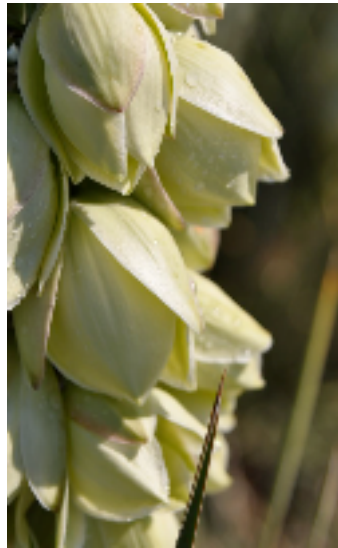
Dew on the Yucca