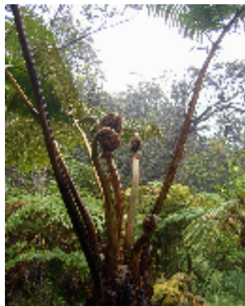
Fiddleheads in a Fern Forest By Denise Rust