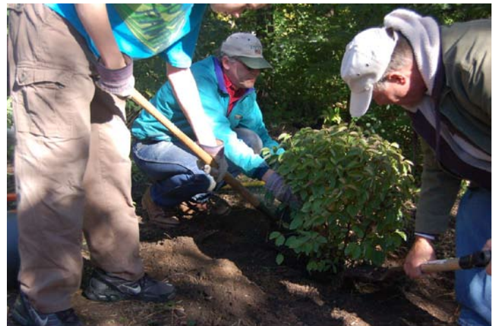
... and finalizing the planting.