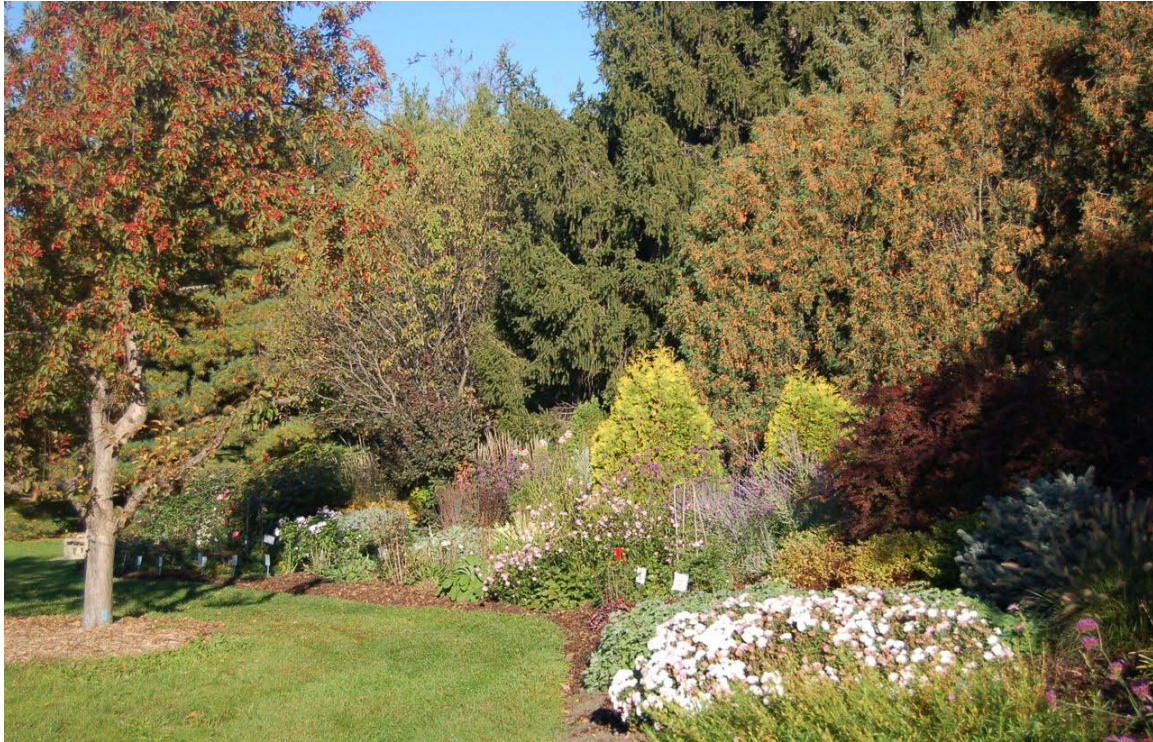
The Men's Garden Club Perennial Garden across from the Lake Harriet Rose Garden -- if you haven't seen it recently, stop by and take a look.