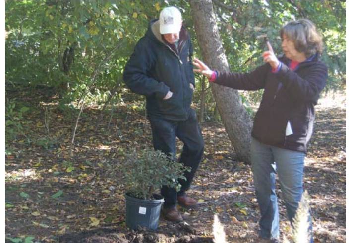
... discusses finding just the right planting location...