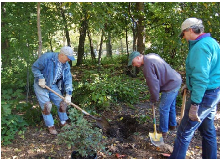
... digging the hole...