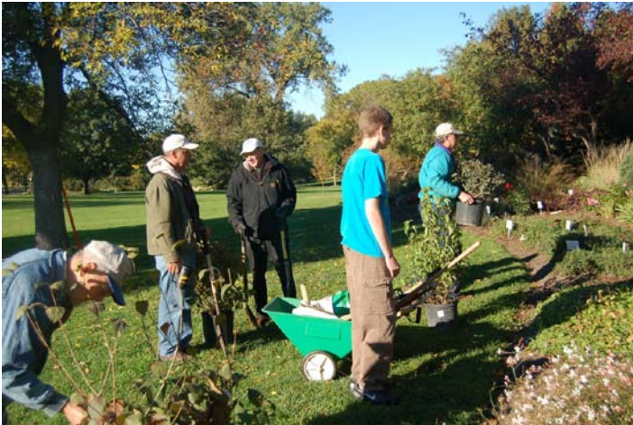
The committee gathers...