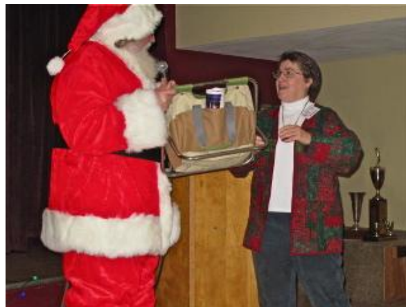
Santa provides a way for the Lazy Gardener to sit down while weeding. If she actually does any weeding...