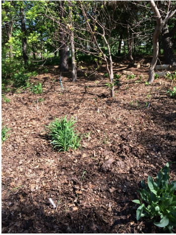
The Native Garden before...