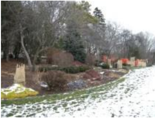
Lyndale Park all wrapped up for winter.

The order for annuals from Rush Creek Growers was turned in to the park gardeners at the end of 2015. (Check out the Rush Creek Growers website for great photos of the latest annuals and perennials.) A design and plant procurement meeting is planned for Tuesday, February 23 at 12:30 at Curran's Restaurant.