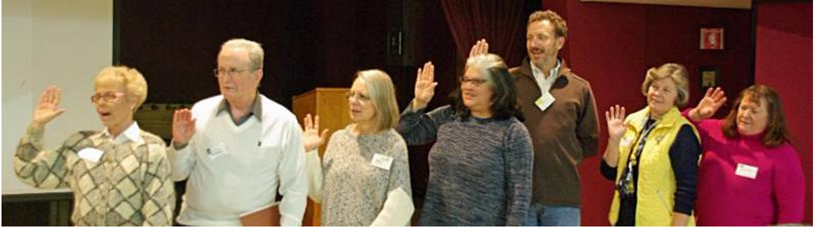
2017 board members receiving the not-so-solemn oath of office at the January club meeting.