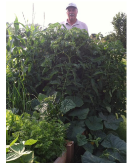
Plants grown in this mix after six weeks.

I'm looking for one or two club members who want to try it in a raised vegetable bed and are willing to take notes on how it does. Since this isn't a soil amendment, it should be used in a new bed rather than in one that's already holding soil.