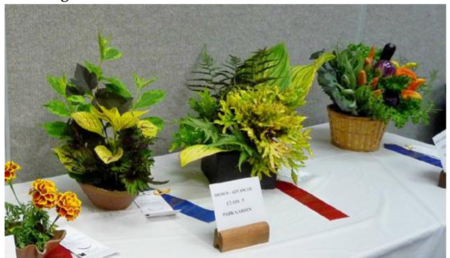
A few designs from the 2012 show.