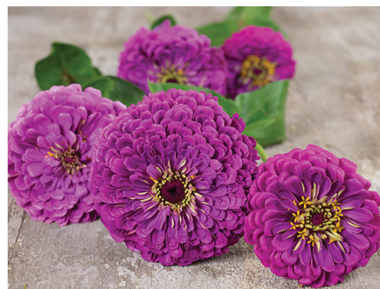
Zinnia 'Purple Prince'

Minnesota Horticulture Society 6-packs of native perennials for bees, butterflies, and monarchs.