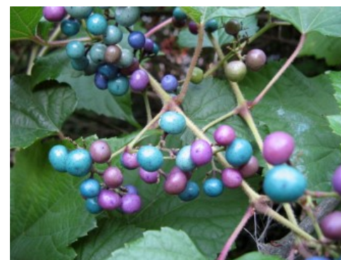
Porcelain Berry Vine

Love will be at our plant sale. We will have Love Lies Bleeding, an amaranthus and Love In a Puff, a climbing vine with very small flowers but with seed pods that are lime green dangling on the vine. There will also be a clematis called Radar Love with yellow flowers and fuzzy puff ball seed heads that last into the winter.