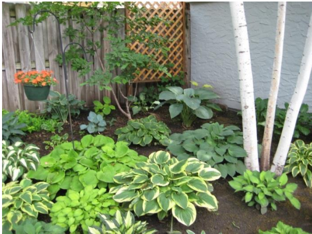
Here's a photo of one corner of Steve's garden in the spring.