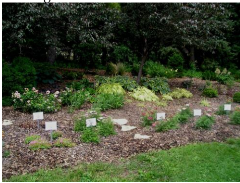
Trial plants in 2008