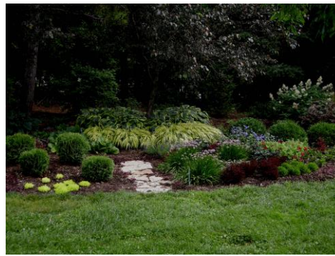
The same area in 2013

The past two seasons, the park garden committee has planted the land once reserved for trial plants with beautiful well designed gardens. The new gardens are much more attractive than the rows of trial plants, and the gardens are getting much more attention. We have created areas or bays along the border, outlined with shrubbery. In these areas we can feature annuals one year, the latest perennials, or ornamental and edible vegetables another year. The Park Board's sign on the boulevard reads "Trial Garden." I don't know if they will change the name of the garden, but even without the U of M's perennial trial project, we continue to have a significant display of the latest varieties. And we are "trying" some experiments of our own!