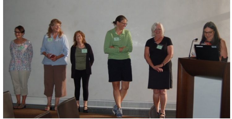
Welcoming new members at the June meeting.