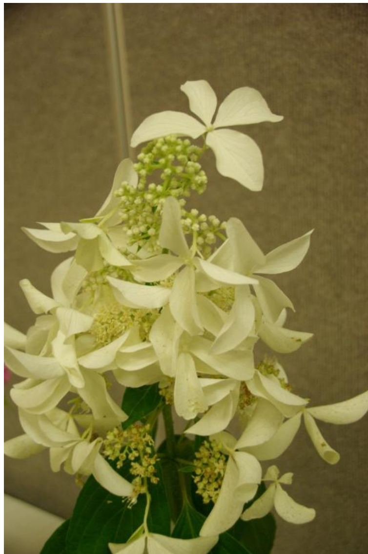
Blue Ribbon hydrangea from Flower Sweepstakes winner Larry Larson