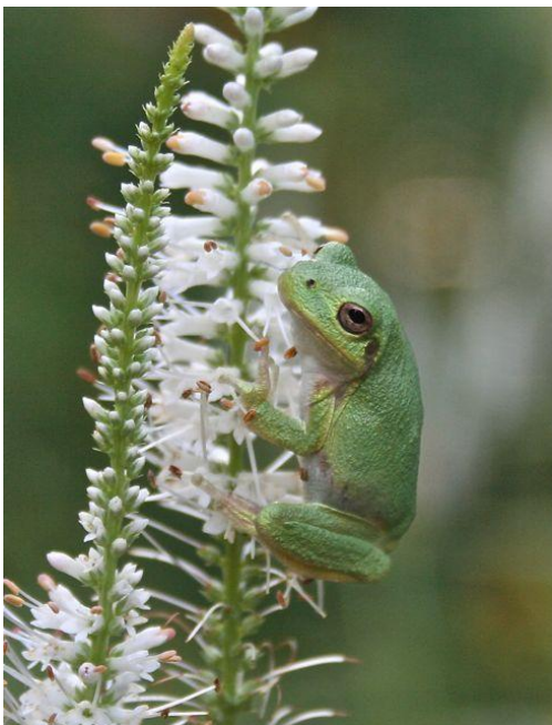
1 st Place: Frog on Culver's root

It's not too soon to start thinking about next year's photo contest. This year, we only had six people entering photos for the People's Choice, and nine people entering photos for the regular contest. If I can win a first now and then, anybody can!