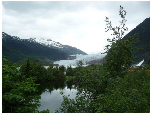
3 rd Place: Mendenhall Glacier, Alaska -- Judy Berglund