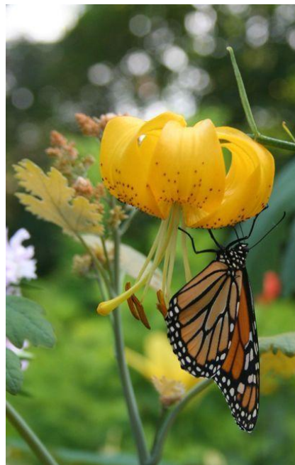
2 nd Place: Lilium Citronella & Visitor -- Gary DeGrande