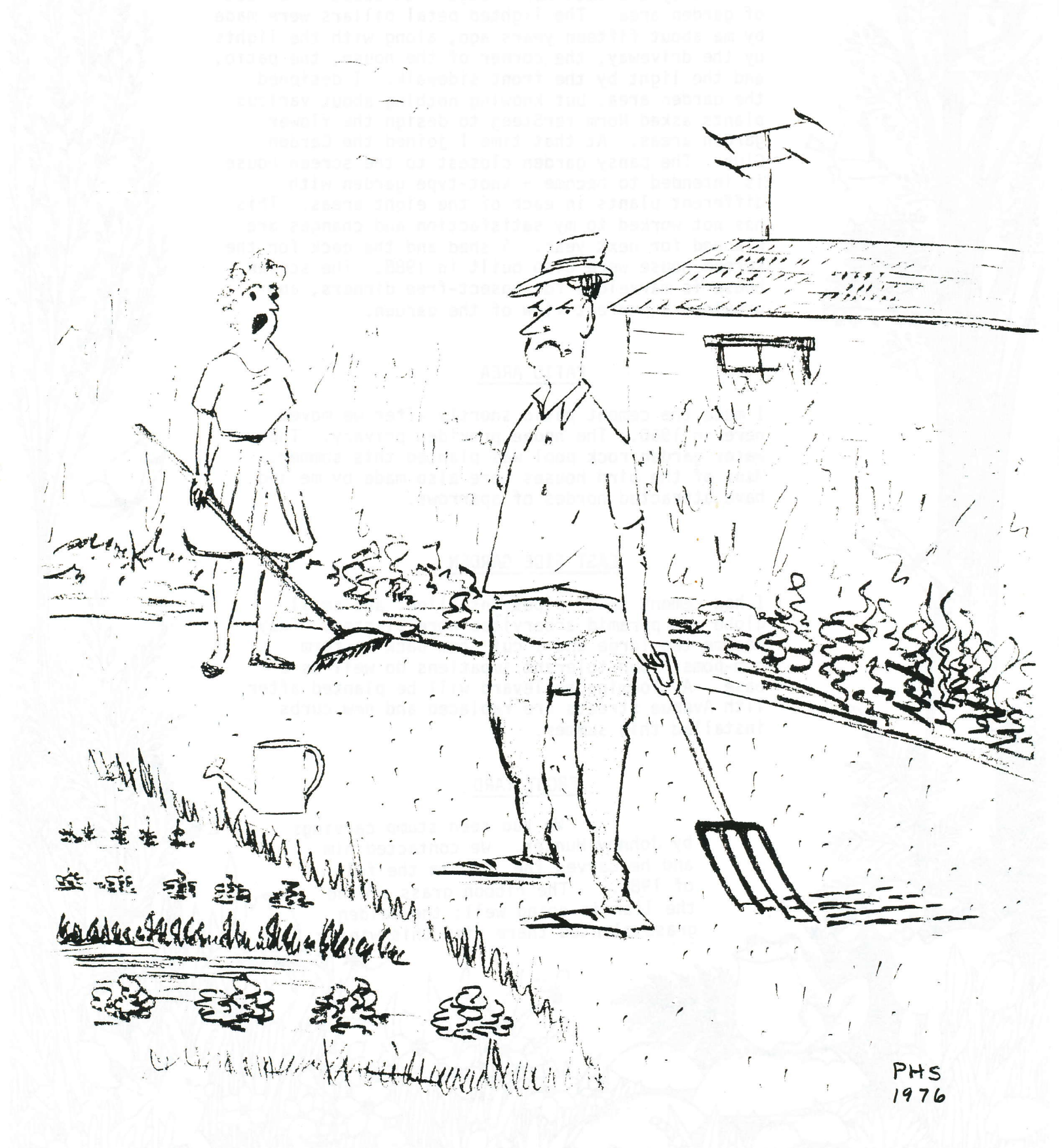
WHAT BECAME OF ALL THAT SEED CATALOG ENTHUSIASM?