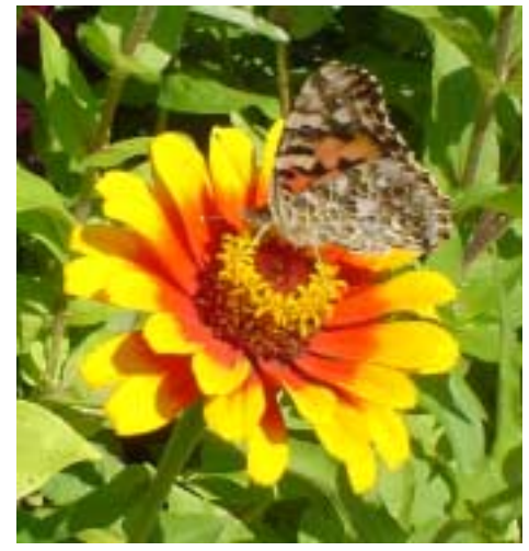
A Painted Lady butterfly on a Whirligig Zinnia See story on page 2

She lives in St. Louis Park with her husband. They just finished a remodel of their home which caused a redo of the garden landscaping. I haven't seen it since the renovation but I am sure it is, as before a peaceful and tranquil garden area.