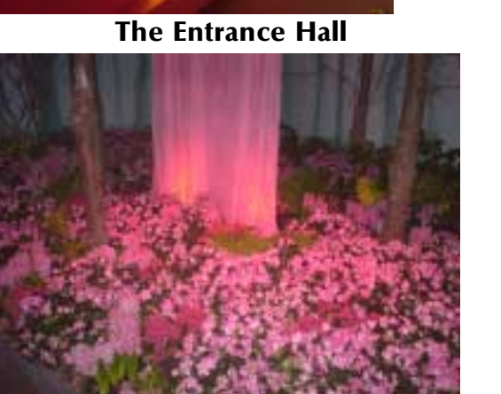
The Pink Splash