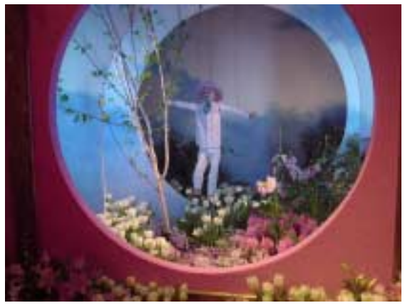
The Scarecrow Room