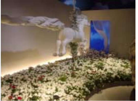
The White Horse