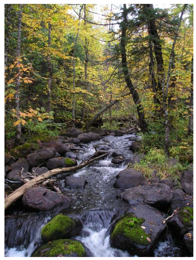
North Shore splendor

"A díplomat ís a man who always remembers a woman's bírthday but never remembers her age."