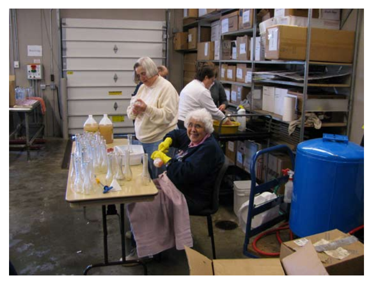
The bottle washing crew