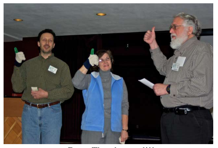
Green Thumb award!!!