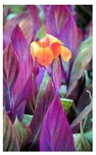
Canna phaison 'Tropacanna'

Well, this should give us enough information so that we can all go out with our shovels and rearrange all of our perennial borders. Well, maybe not us Lazy Gardeners. We will visit everyone else's gardens and admire!