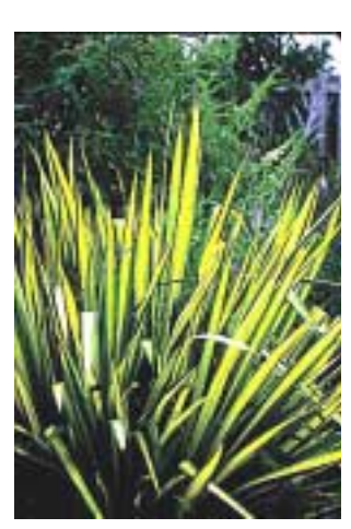
Yucca 'Golden Sword'

And if you don't mind corralling them every few years, plume poppies are great.