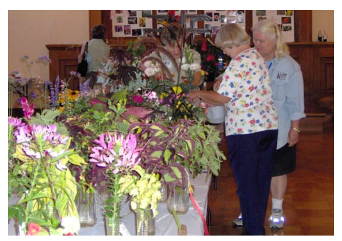
Display tables at the 2006 The Sept.

This year's Flower, Vegetable and Photography show will be held in the MacMillan Auditorium of the Oswald Visitor Center at the Arboretum. The weekend of the 18th and 19th is billed as "Flower Fest" at the Arboretum, and will include both our show and the Arboretum/Federated Garden Club show, along with other special events and classes by the various plant societies.