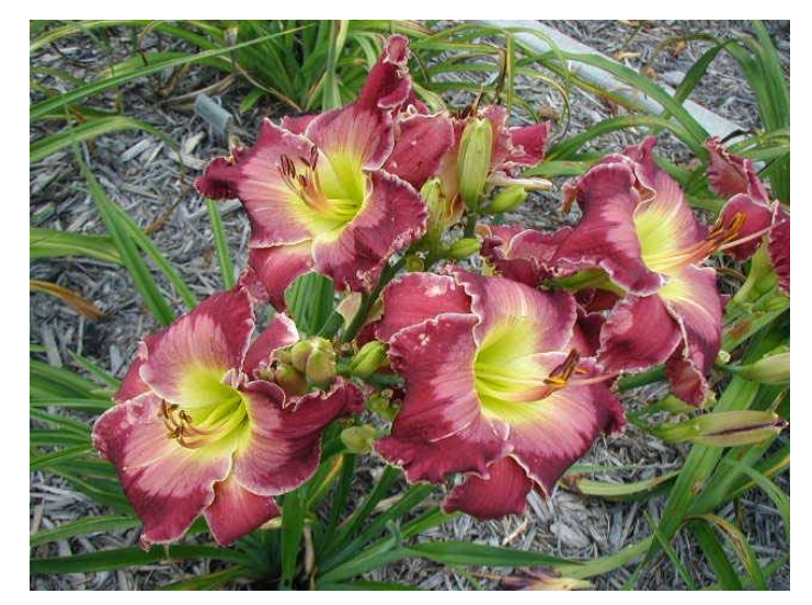
"Isle of Patmos" - 2007 Introduction from Springwood Gardens