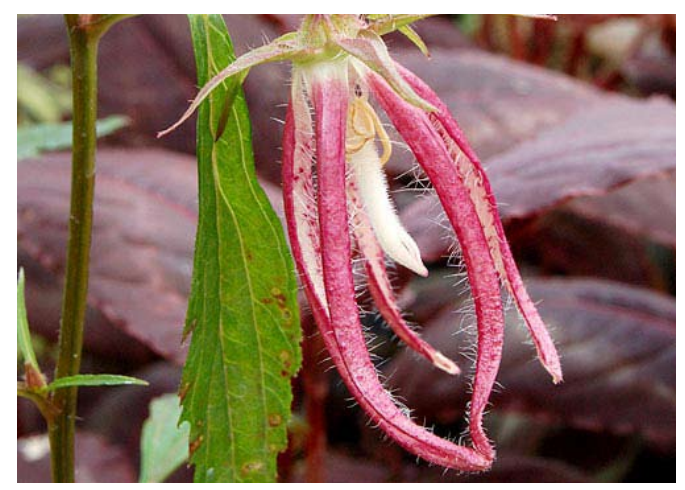
Campanula 'Pink Octopus'

The Campanula Pink Octopus (pictured below) has Japanese lantern buds that open to reveal striking pink octopus-like flowers. The flowers weep down from the upright flowering branches and have a long bloom time. They grow 10-18" high. Full sun to part shade.