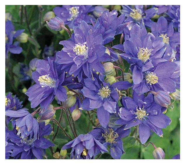
Aquilegia 'Clementine Blue'

The Achillea Tutti Frutti Strawberry Seduction Plant (Yarrow) is a strong year round bloomer that features pink flowers on disease resistant foliage. It likes full sun and infertile, well-drained soils. About 26" in height, it also attracts butterflies.