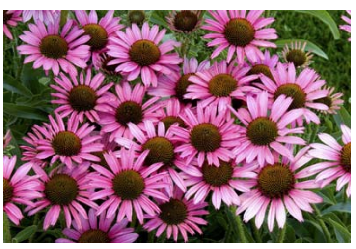
Echinacea 'Pixie Meadowbrite'