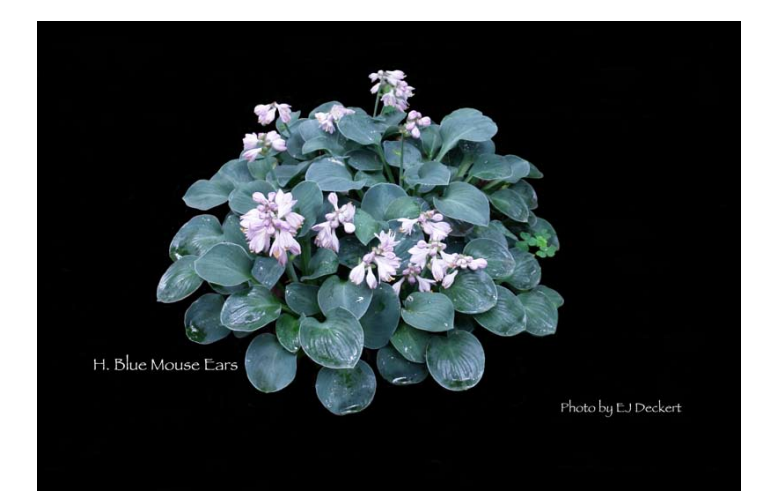
Hosta 'Blue Mouse Ears'

Other new interesting perennials are the yellow Ligularia "Twilight" that is only 2-3 ft tall and sports yellow flowers, a fern leaf Peony "Rubra Plena" that will set you back about $70, a yellow Rudbeckia called "Goldquelle" that does not have a black eye, a dwarf Goldenrod called "Little Lemon" that is only 12" tall, and finally, a Tricyrtis Samurai, which is a toad lily with lily like light purple spots. Whew! That's enough for now!