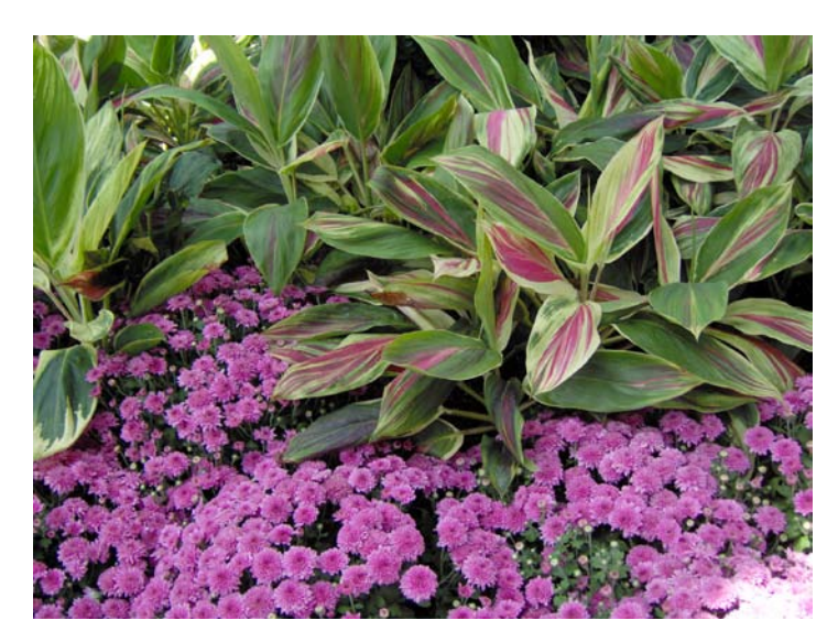
Ginger and Mums

Wasn't September beautiful? Except for our water bills? It's been interesting to see how plants have performed during this cool, dry growing season. The dahlias are thriving. Some of the warm-season annuals that just sat there all summer have perked up a little. And the impatiens are as big as I've ever seen them.