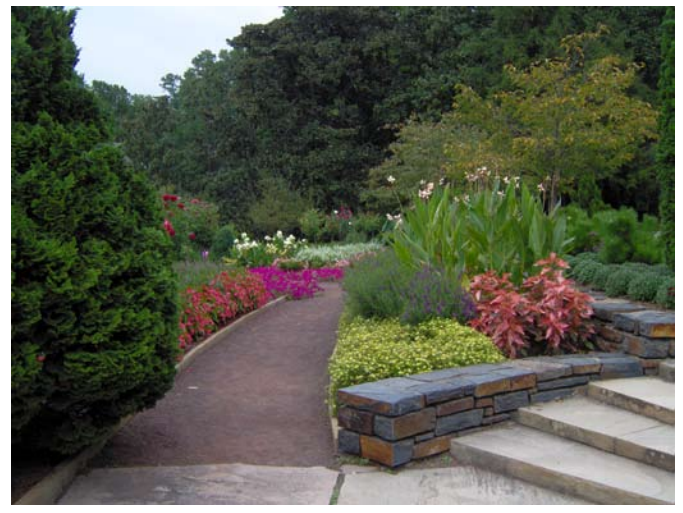
Sarah P. Duke Gardens

Elsewhere in this edition, you will see the proposed slate of officers for 2010. We will be voting for 2010 officers in November. The Nominating Committee has done a fine job of recruiting new officers and directors, and I am grateful for everyone who has agreed to be on the slate. I am also grateful for the current board members who are rotating off the board after this year. We all appreciate the contribution you have made to the club.