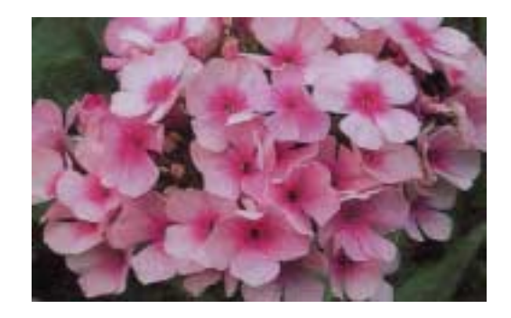
Phlox 'Bright Eyes'

The plants that remain and the shards they recover, will give them the same joy of discovery that I had in my new back yard.