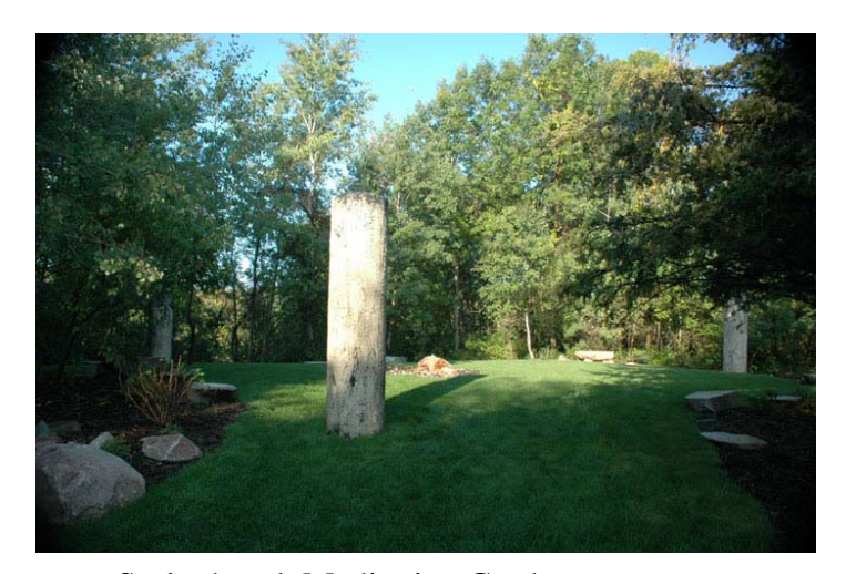
Springbrook Meditation Garden