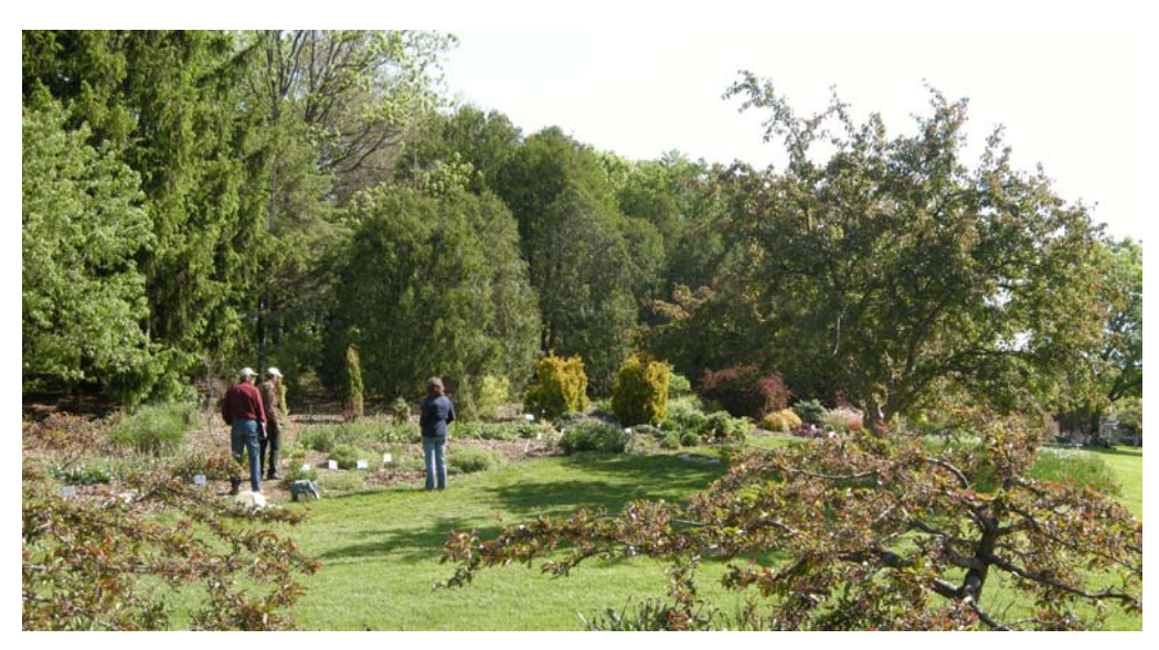
Panoramic view of the garden