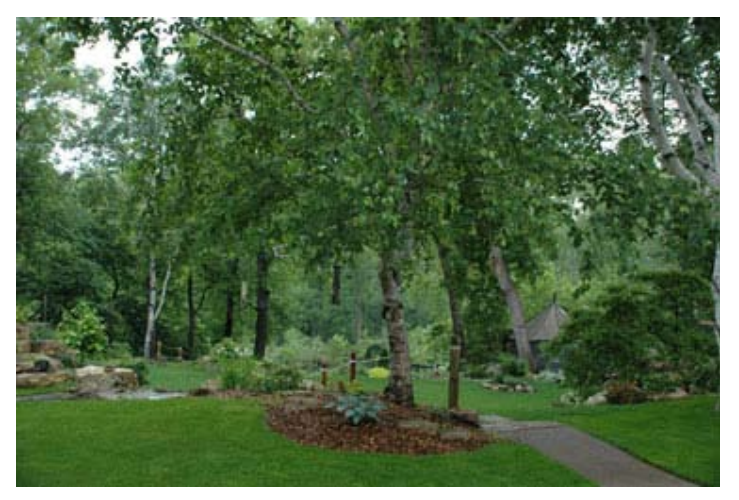
Betty Ann's Garden

Don & Jim first had their gardens on the club tour of 2006, and were the winners of the Lehman Trophy that year. They have a rose garden in the front of their property, along with a koi pond and a sitting area. Their gardens run along the left side of their home, and through many terraced gardens with waterfalls in the back to the shores of Schmidt Lake at the far end of their property. Their collection of 70 some shrub, old, and climbing roses should be at their peak season bloom. New at the gardens of "Der Serenity Garten Platz" (Serenity Garden Place) are two garden paths – a formal paver's path through the English rose garden and a flagstone path leading to a new alpine garden. Some 50 new shrubs and small trees have also been planted in the garden since the club last visited.