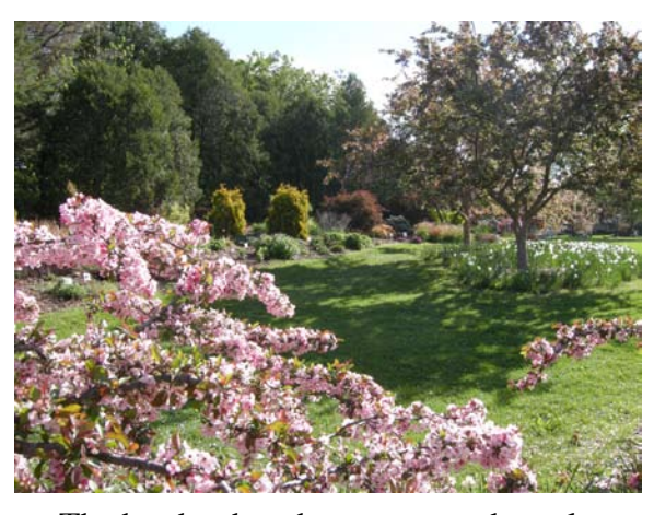
The border thru the sargent crab apples.