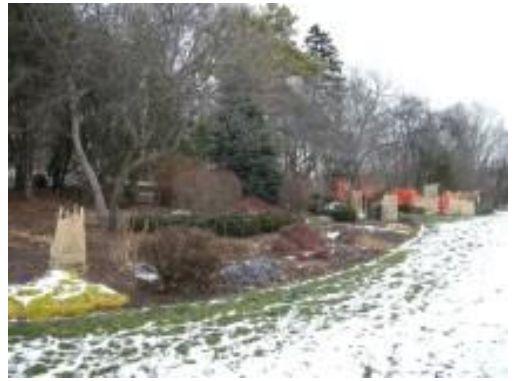
Lyndale Park all wrapped up for winter.

The order for annuals from Rush Creek Growers was turned in to the park gardeners at the end of 2015. (Check out the Rush Creek Growers website for great photos of the latest annuals and perennials.) A design and plant procurement meeting is planned for Tuesday, February 23 at 12:30 at Curran's Restaurant.