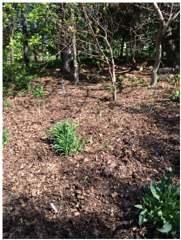
The Native Garden before...