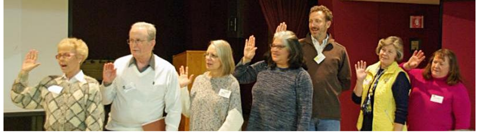
2017 board members receiving the not-so-solemn oath of office at the January club meeting.