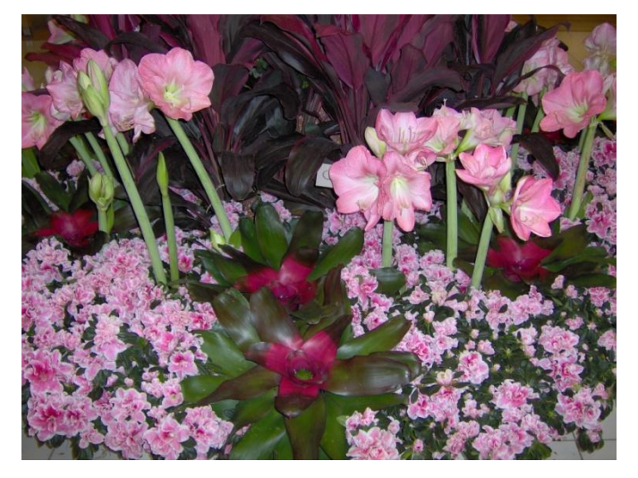
From a Macy's-Bachman's Flower Show a few years back.