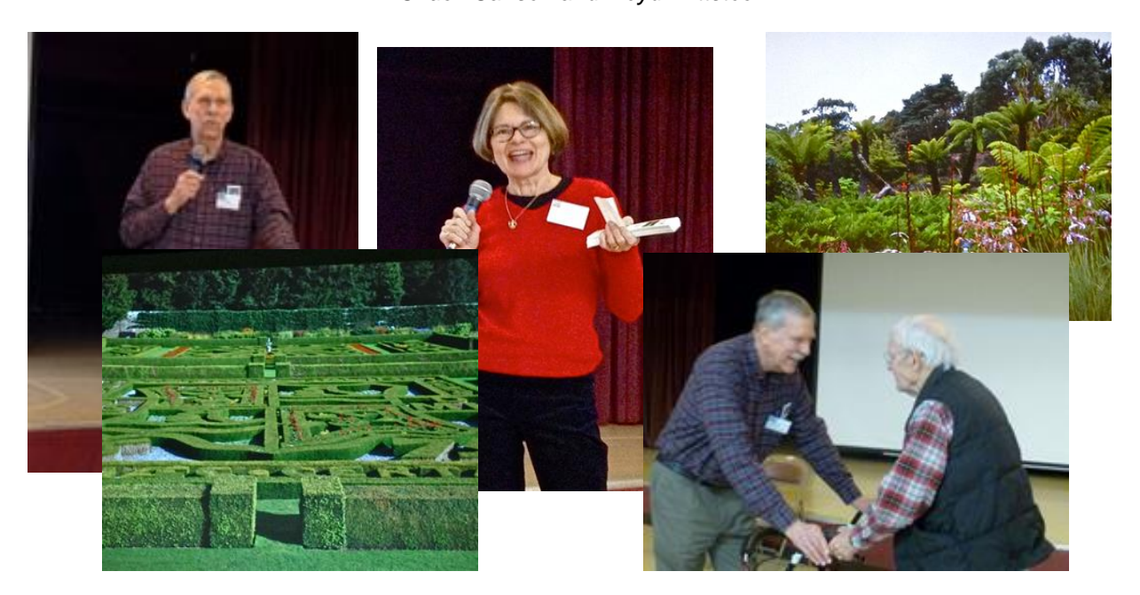
The Garden Spray Page 5 <a href="http://www.mwgcm.org">http://www.mwgcm.org</a>