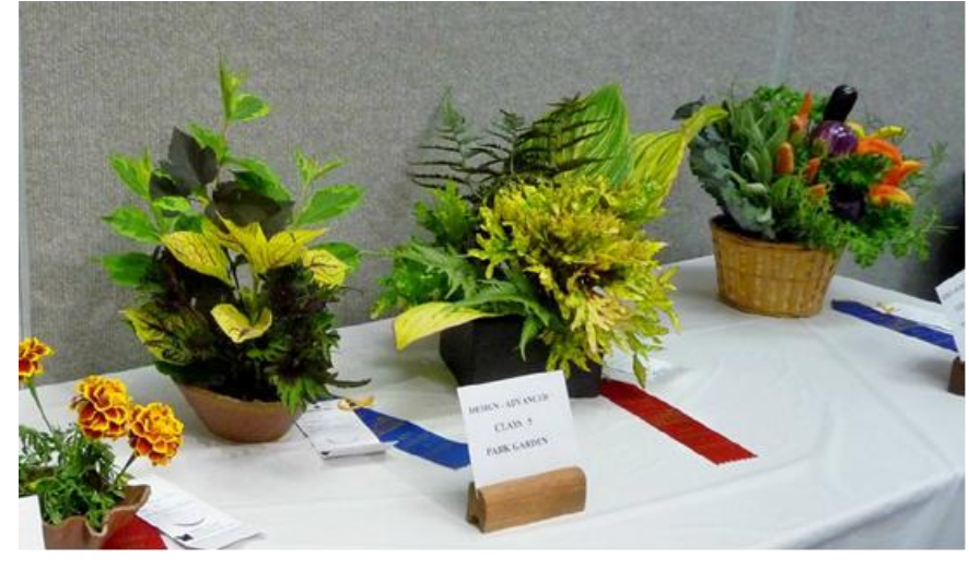
A few designs from the 2012 show.