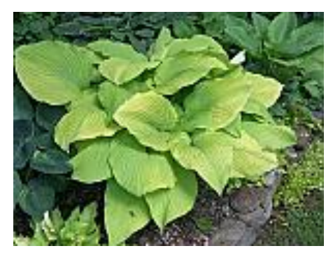
H. 'Blaze of Glory'