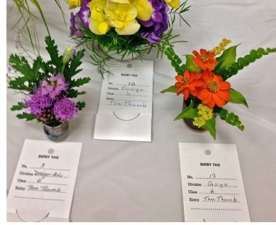
A sample of 2013 miniature design entries.

This division historically has had very few entries, but last year's response was wonderful. So get your creative juices flowing and keep up the great work with floral arrangements in this year's FFF Show.