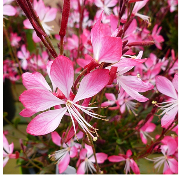
Gaura 'Little Janie'

Variegated sweet potato vine Green and lime green foliage with small blue-white flowers.