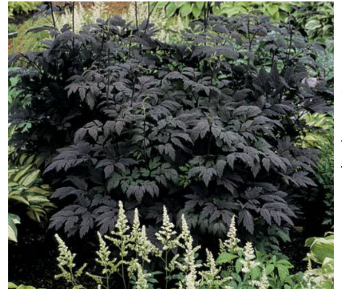
Cimicifuga ramosa 'Hillside Black Beauty' Dark purple to nearly black foliage reaching 3 ft. tall with white flowers in late summer. Best foliage color in light shade.