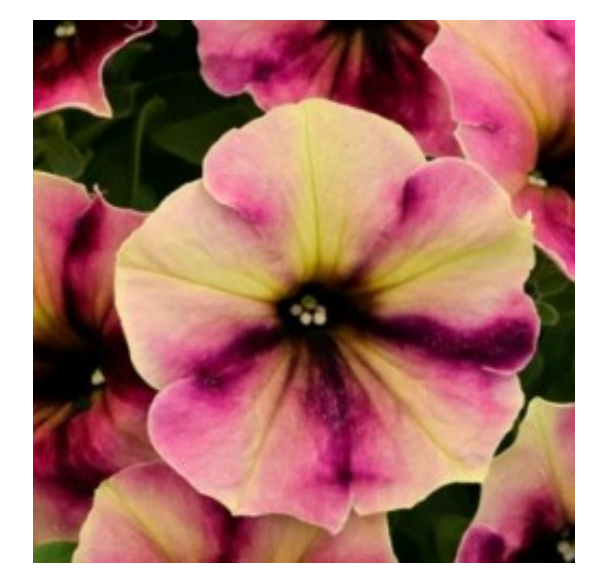
Petunia 'Crazytunia® Blackberry Cheesecake'

Begonia 'Exotic Bossa Nova'® This red begonia has a trailing habit, so works best in containers or hanging baskets. Sun or partial shade.