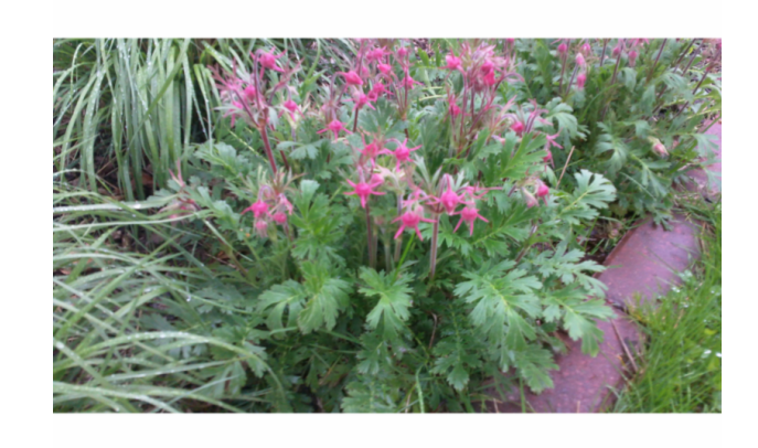
The Geum triflorum (Prairie Smoke) edging the native garden had only a single blossom open on the first day of garden work, April 24, but each of the clumps will look like this soon.

Hollow stems which may harbor insect larva waiting to mature into pollinating insects will be bundled and stacked in an out-of-the-way corner of the gardens. This will allow the insects to break out of their stems when the weather is appropriate. Stems can be cut nearly to the ground and handled carefully so that resident insects are not disturbed before they're ready to hatch into the world.