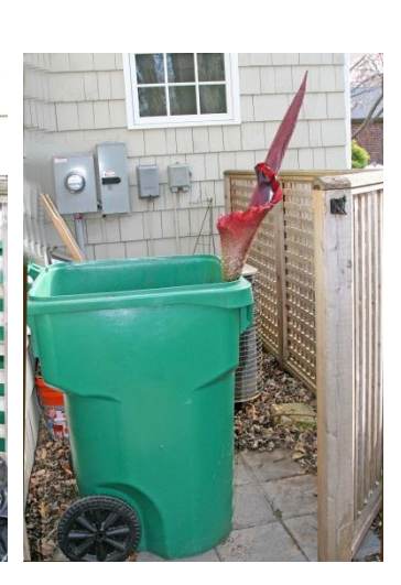
The Garden Spray Page 8