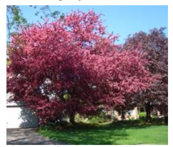
'Red Splendor' crabapple

Today I noticed some spectacular deep-pink tree peonies had popped open and the small white clematis has also begun to open up. At this time of the year it seems every day has a new display of flowers to admire.