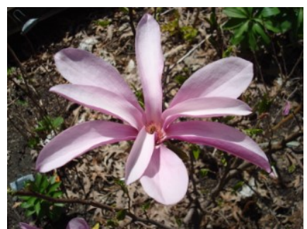
'Leonard Messel' magnolia

I am always fearful that the rains will come before my 'Red Splendor' crabapple is able to put on its show, but this year the rain held off and the heat we had before the monsoons hit encouraged the tree to shine in all its glory.