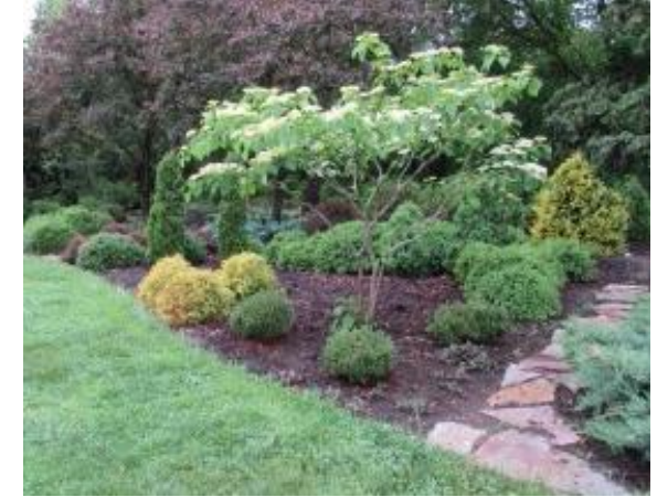
Pagoda dogwood in bloom.