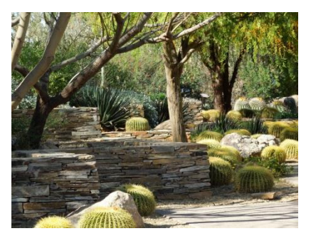
Cactus Garden by Audrey Grote 2012

For inspiration, here are a couple of winning photos from previous years. For even more inspiration, go to our website and click on "Photo Show Winners". You'll see slide shows of photo contest winners back to 2003.