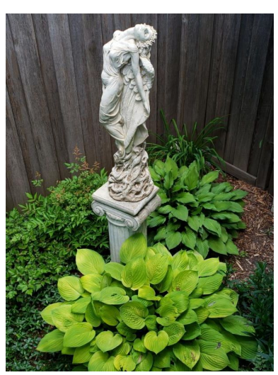
A vignette from Tracy Sanders' garden.