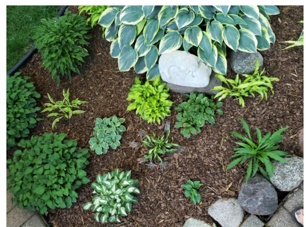
A small sampling of Steve's amazing hosta collection.