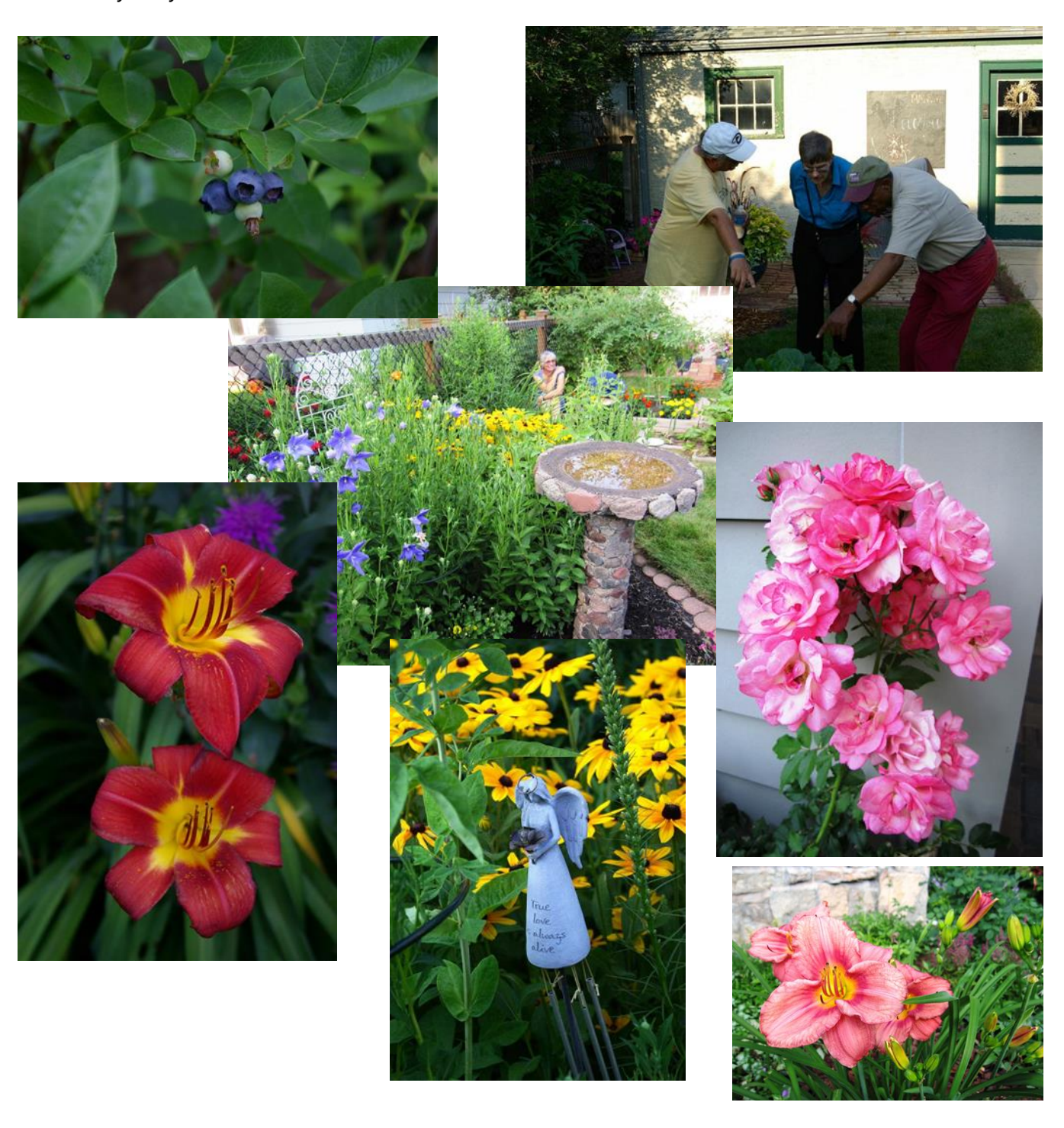
The Garden Spray Page 9 <a href="http://www.mwgcm.org">http://www.mwgcm.org</a>