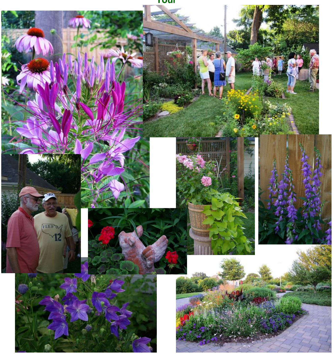
The Garden Spray Page 10 <a href="http://www.mwgcm.org">http://www.mwgcm.org</a>