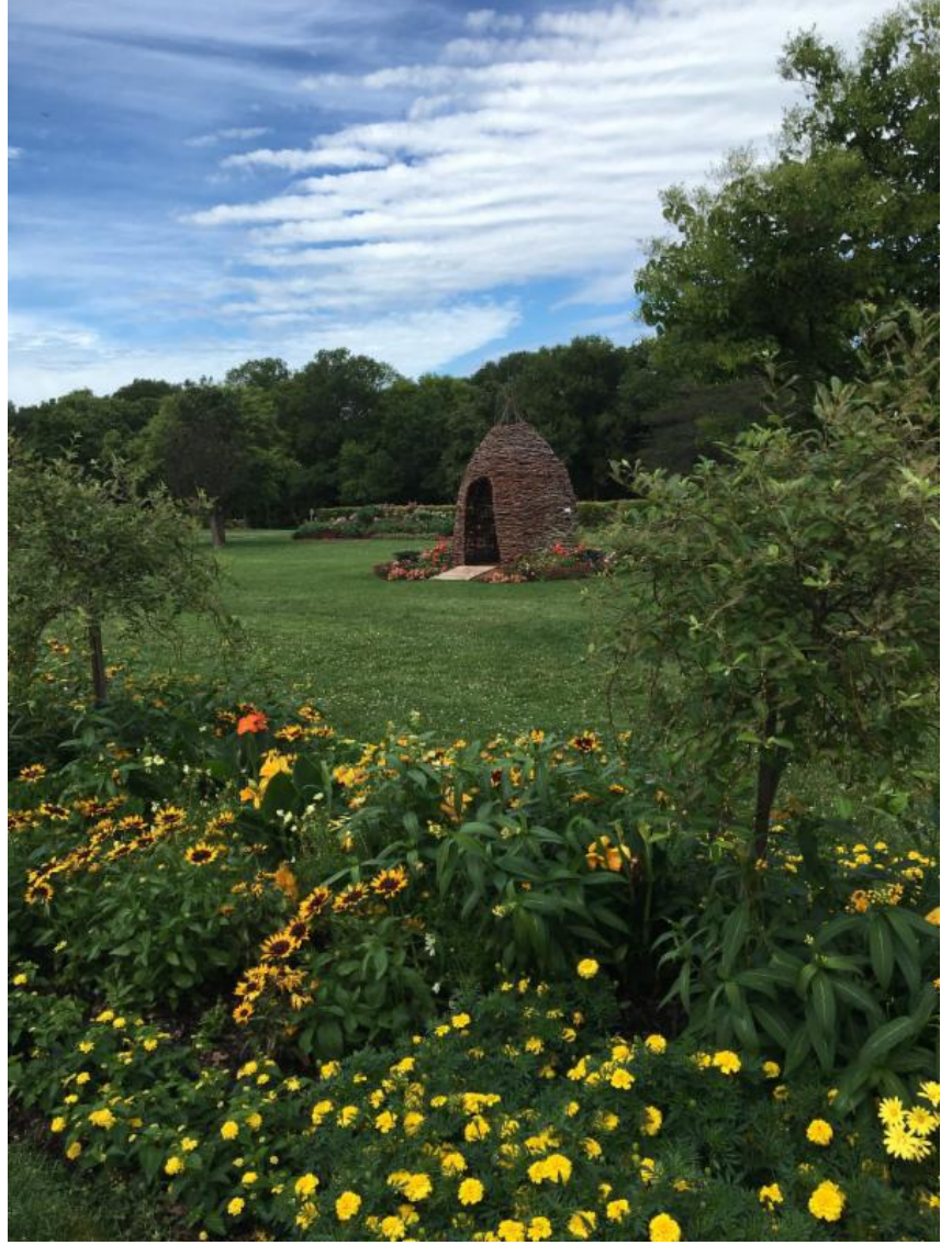
Twig structure in the center of colorful flower beds.

Across Roselawn Road we were introduced to the formal and informal beds, the care of which Andrew inherited in some cases and is developing in other cases. He added perennials to soften the edges of the peony beds at the entry to that part of the Lyndale Park gardens; they are insignificant when the peonies are in bloom, but are now showing off their own blossoms, as the peonies offer an herbaceous background.