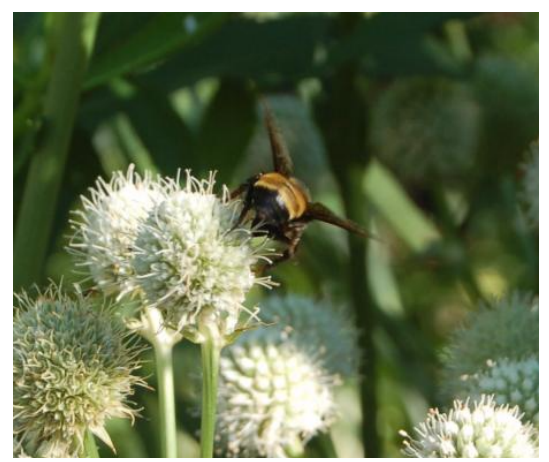
Native bees are enjoying the Erynigium yuccifolium (rattlesnake master) in the native garden.

July saw a lot of progress in the native and shade gardens with good participation in spite of heat and humidity. We built support structures around clumps of native plants using Andrew Gawboy's sticks-and-grapevine with Kathy Lenarz providing yards of grapevine cuttings. It's fun, attractive, and it works! As the supports go up, it's possible to see and remove weeds and other invasive plants, so the garden looks more intentional.