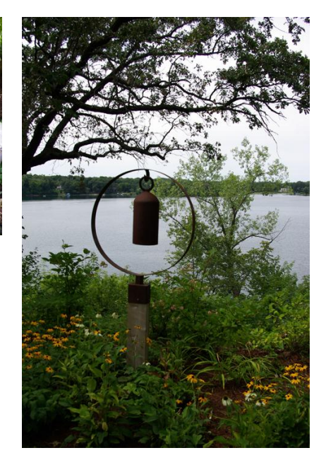
The Garden Spray Page 11 http://www.mgcm.org