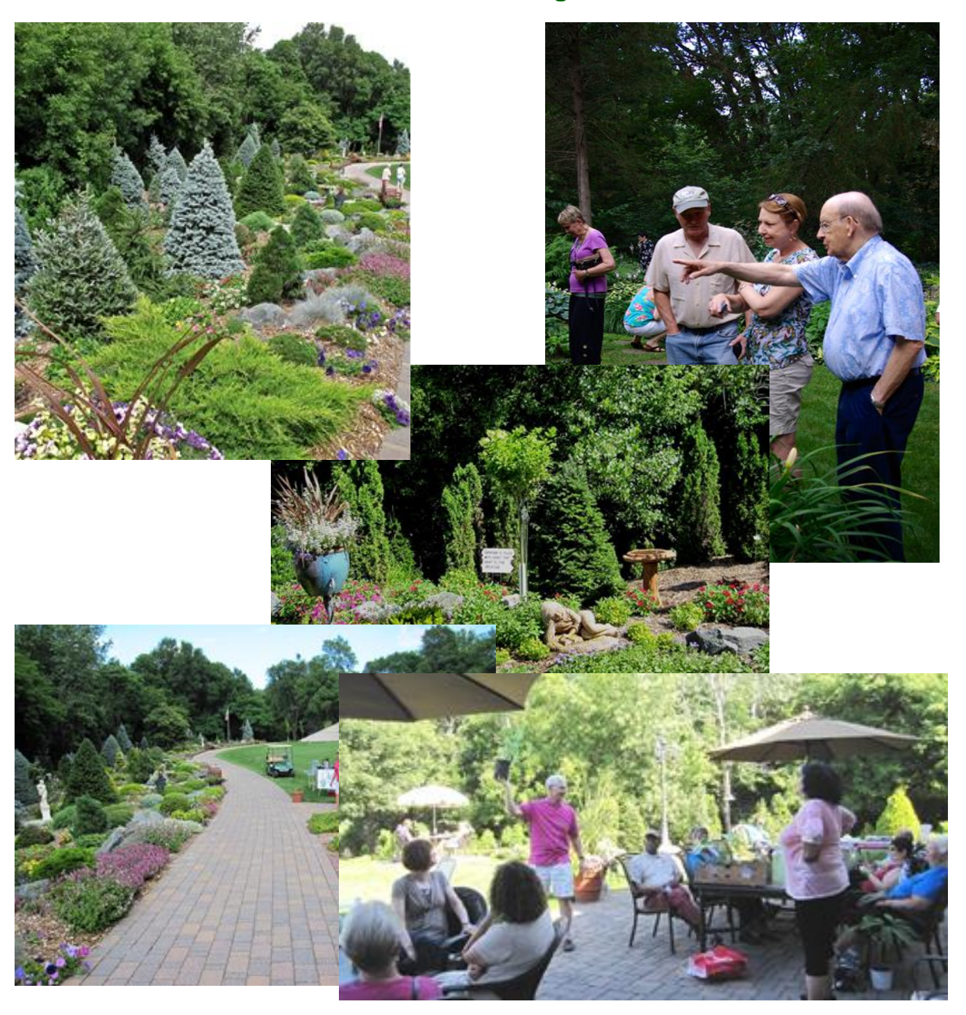
The Garden Spray Page 8 <a href="http://www.mwgcm.org">http://www.mwgcm.org</a>