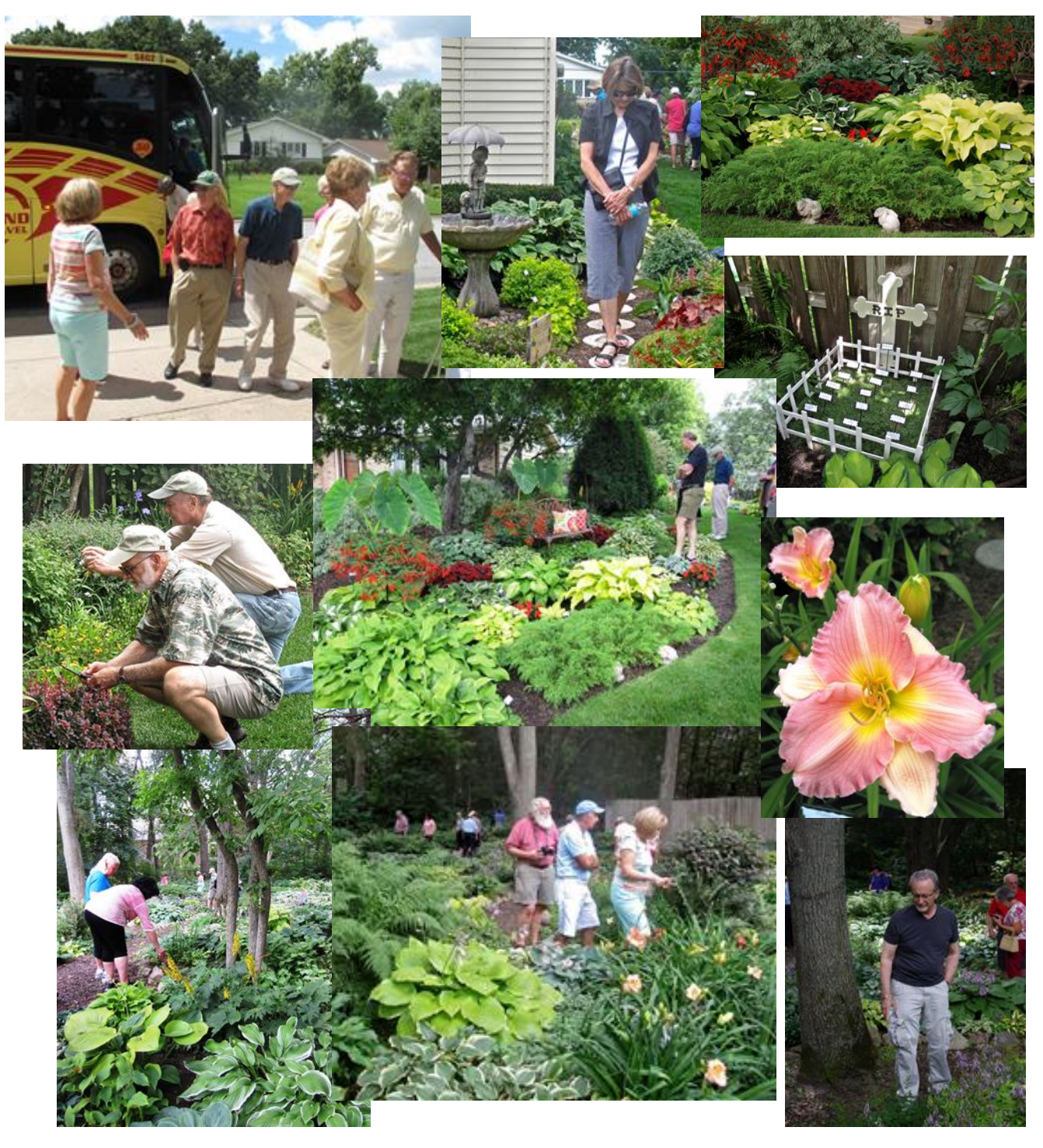
The Garden Spray Page 7 <a href="http://www.mwgcm.org">http://www.mwgcm.org</a>