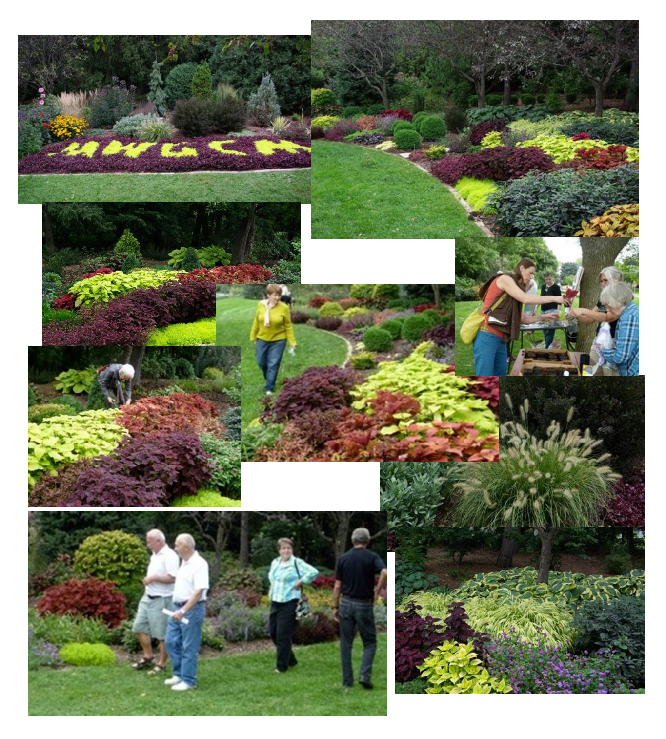
The Garden Spray Page 9 http://www.mwgcm.org