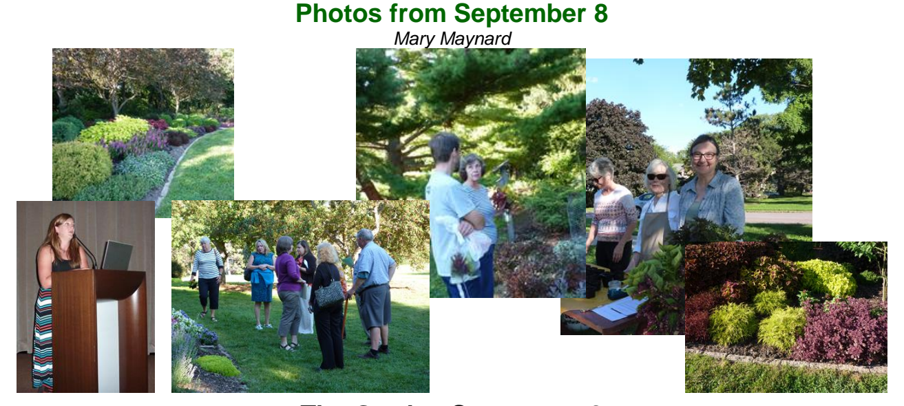
The Garden Spray Page 8 <a href="http://www.mwgcm.org">http://www.mwgcm.org</a>

The November Spray will have the reservation form and all the pertinent information about this event. For all you new members who have not yet attended this event, please consider coming because this is one of the best events of the year! I'll be seeing you!