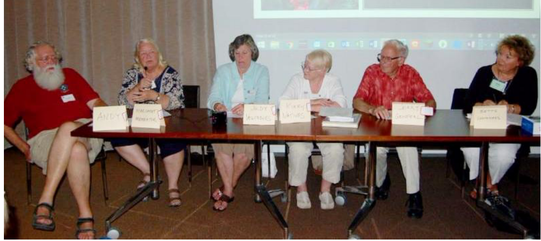
Our panel of experts at the September meeting.

The 75th Anniversary committee has planned a special celebration for the October 10 meeting. The MWGCM was chartered by the Men's Garden Clubs of America as the Men's Garden Club of Minneapolis on