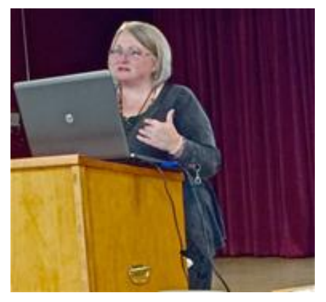
The Garden Spray Page 8 http://www.mwgcm.org