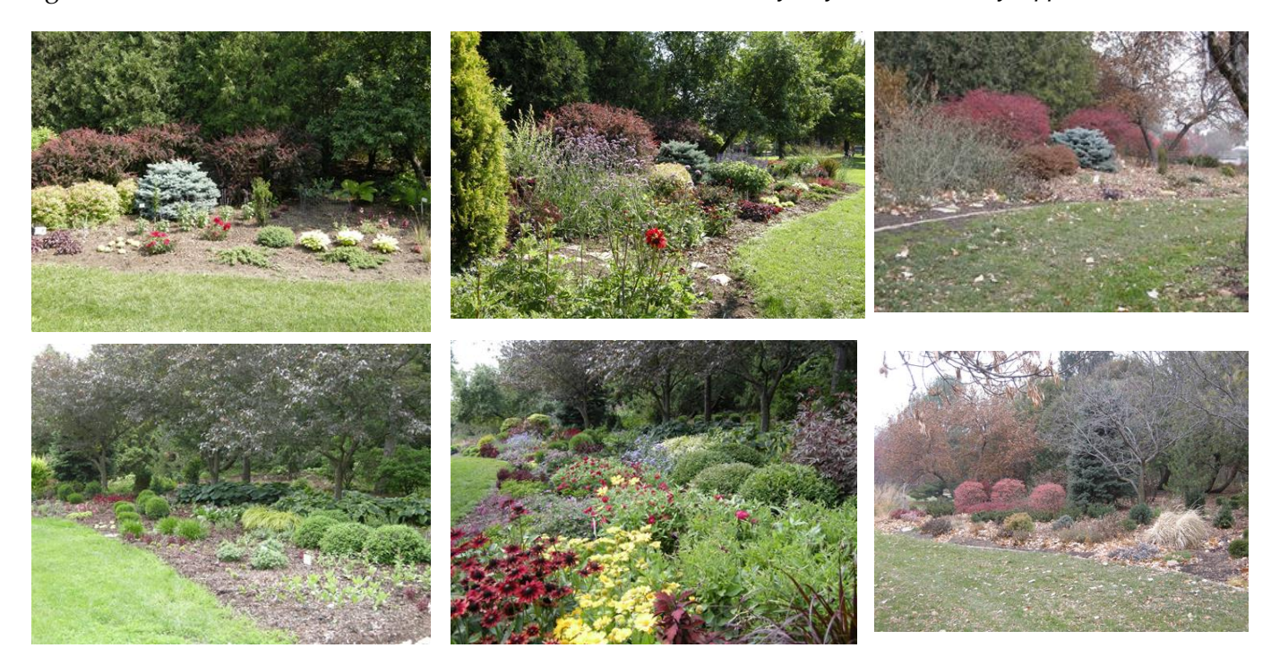
The Garden Spray Page 7 <a href="http://www.mwgcm.org">http://www.mwgcm.org</a>

Here are photos of the garden in mid-June; at its peak on August 18, 2013; and the same areas again on November 16.